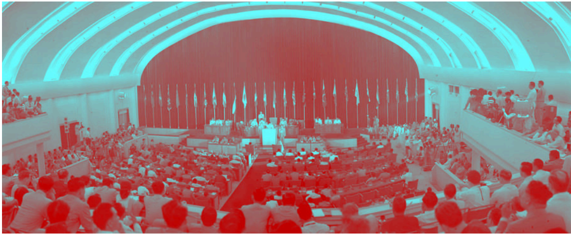
Bandung Conference, 1955

people united will never be defeated,” we must remember that these words are not symbolic. They are a historical truth, because even under siege, facing blockade, war, and imprisonment, the peoples of the world continue to build, care, sing, love, organize, and build mass movements that change the course of history.