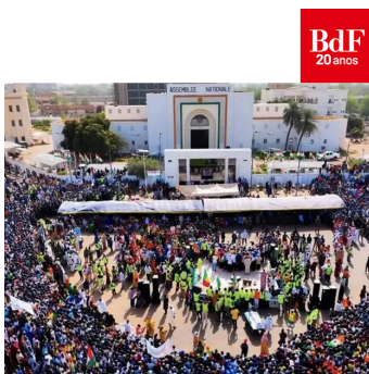
With street celebrations, Sahel