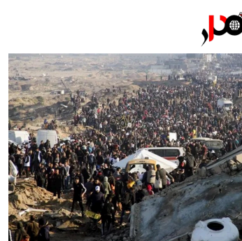
Displacement of Palestinians: the